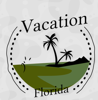
As part of the HAB affecting Florida, the region's massive tourism industry has been harmed as well.