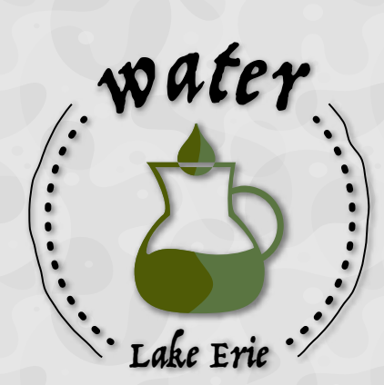
Lake Erie's recurring HAB costs the city of Toledo an average of $3-4 million a year and millions in lost tourism revenue.

HABs can decimate the tourism, water supplies and fisheries on which people depend