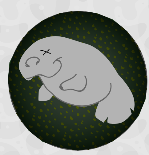
In 2013, a record number (276) of Florida manatees died. Eight manatees have died in 2016.

HABs have negative health effects on humans and animals, like skin rashes, allergies, nausea, liver damage and even death