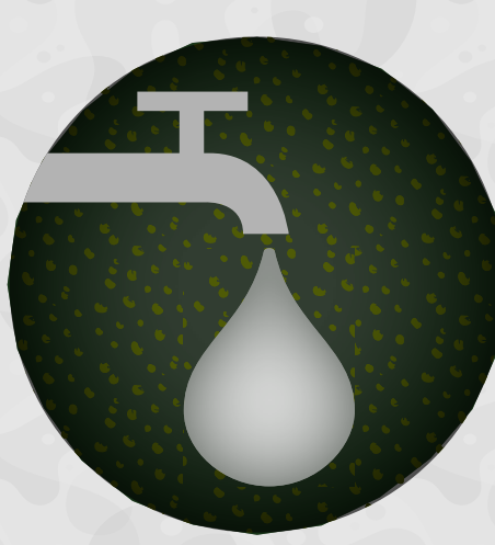
Across the US, toxic algae must be removed from drinking water to prevent illness.