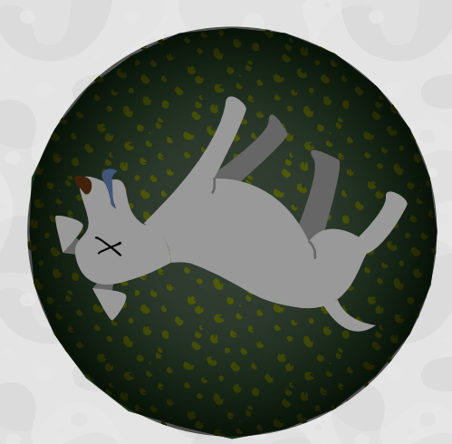
In Minnesota over the past 10 years, 18 dogs have died from contact with HABs in lakes.