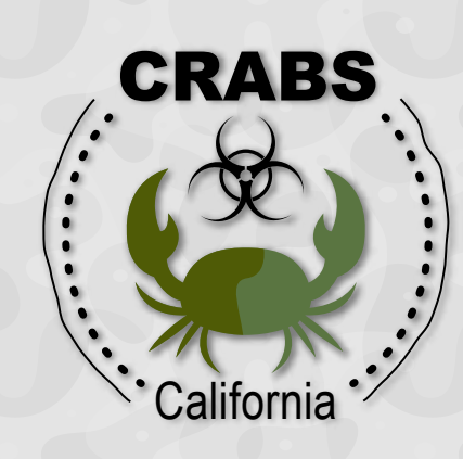
In 2015, a massive HAB made California Dungeness crab poisonous to eat, costing the crab industry at least $48 million.