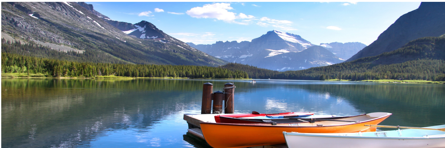
Glacier National Park, Montana